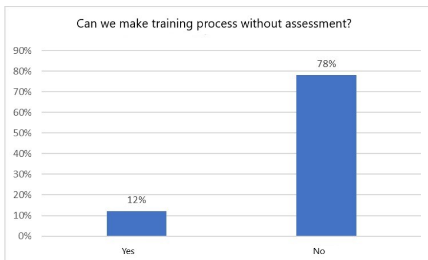
Diagram 2 Teacher's attitude to non-valuable assessment

It is interesting that the attitude of the students to the same question was completely opposite. Unlike teachers, students think that free assessment will have a significant impact on their achievement, will allow them to clearly imagine their own development dynamics, and will create conditions for mutual cooperation rather than sharp competition between students.